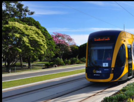
Top: Arundel lifestyle; Bottom Left: Westfield Helensvale; Bottom Right: Gold Coast Light Rail Stage 1\,