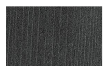
KITCHEN OVERHEAD CABINETRY Laminex Burnished Wood