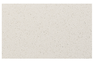
WET AREA BENCHTOP (Excludes Laundry) Caesarstone 20mm Ice Snow