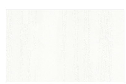
ROBE DOOR POLYTEC MELAMINE COLOUR Classic White