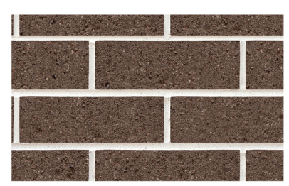
BRICKWORK Everyday Life - Freedom