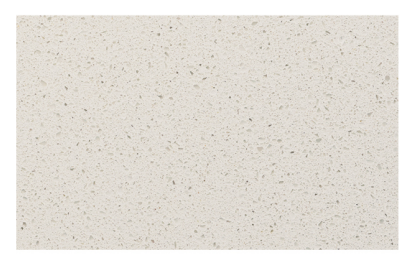
KITCHEN BENCHTOP Caesarstone 20mm Ice Snow