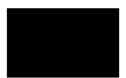
GUTTER Colorbond® Night Sky