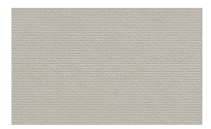
BLOCK OUT BLIND Niagara Zen Illusion