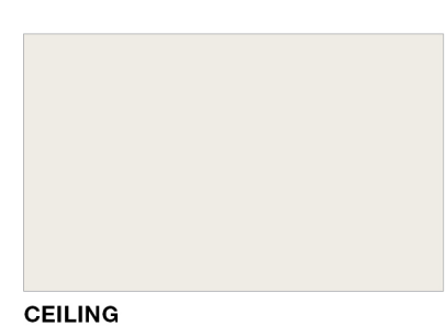
Dulux Natural White