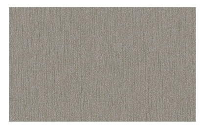
KITCHEN KICKER Formica Stainless Steel