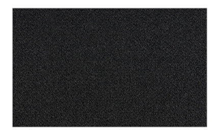
CARPET In The Loop - Channel SC0515