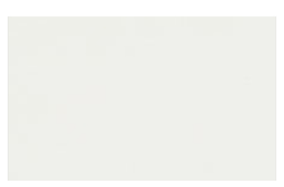
TILED SPLASHBACK BELWPS99 Café Light Cream