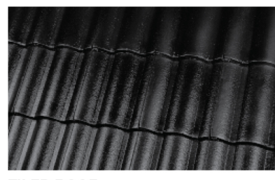
TILED ROOF Monier Elabana Sambuca