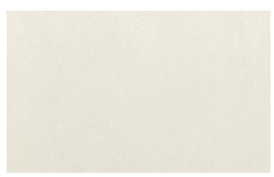
EXTERNAL FLOOR TILE (Design Specific) NT17-5085FL