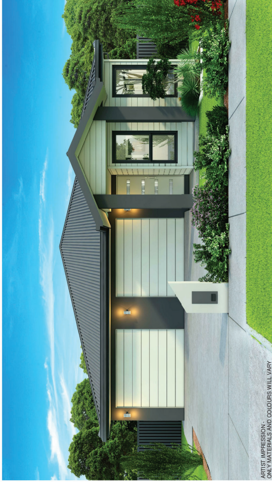
ARTIST'S IMPRESSION - ONLY MATERIALS AND COLOURS WILL VARY

RP DESCRIPTION Lot 31 on SP 301475 Site Area: 480.00 m 2 Local Authority: MBRC