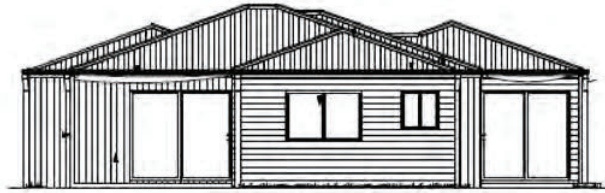
E3 Rear Elevation. (North)