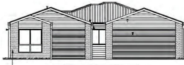
E1 Front Elevation. (South)