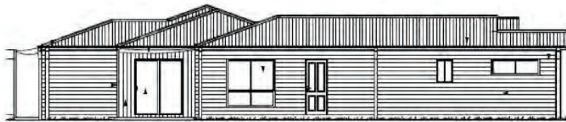
E4 Left Side Elevation. (West)