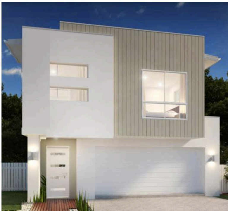
Artist Impression Only – Refer Contract Plans For Actual Plans

BONUS DUCTED AIR-CONDITIONING FOR PROMPT Contract Exchange