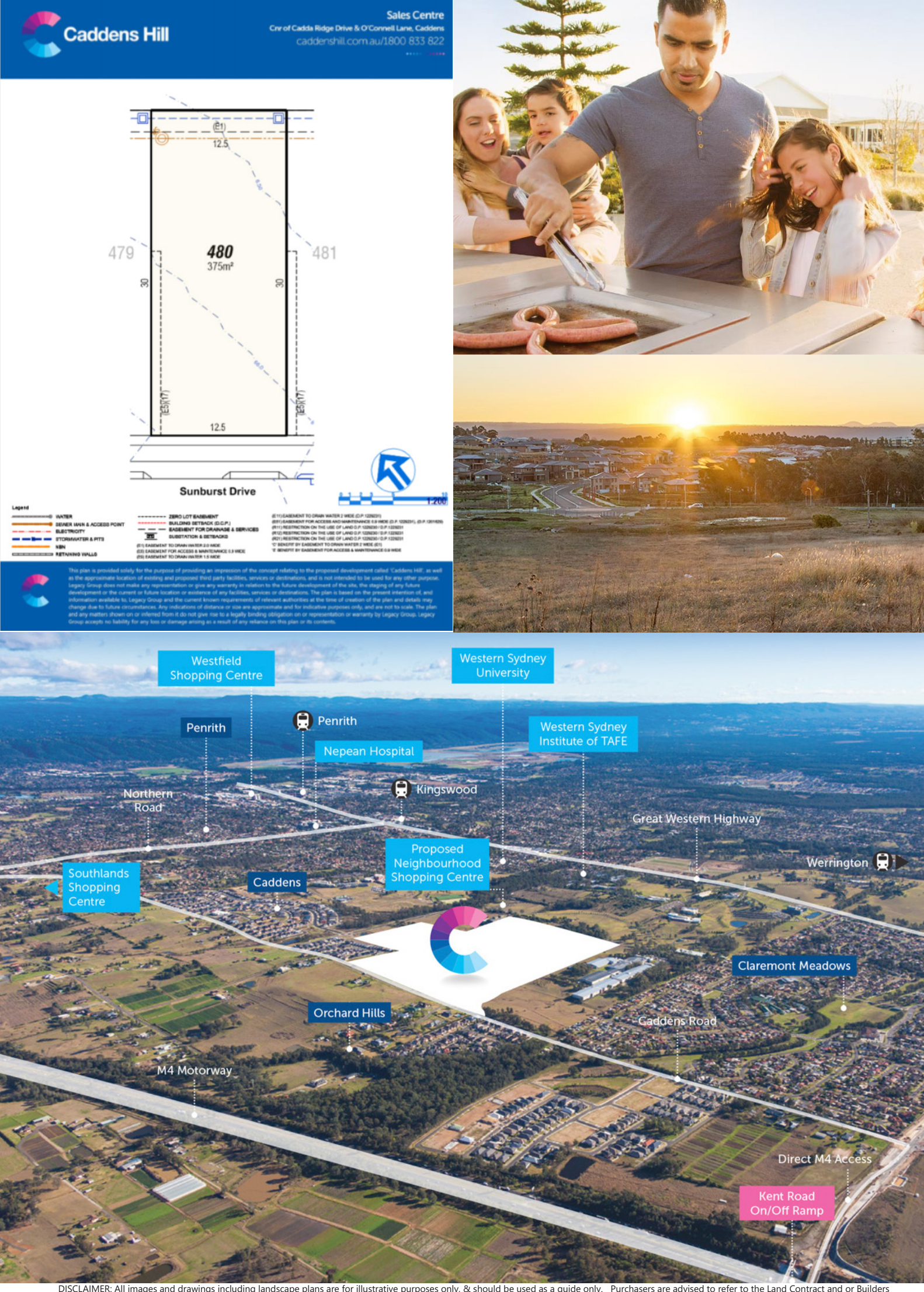
DISCLAIMER: All images and drawings including landscape plans are for illustrative purposes only, & should be used as a guide only. Purchasers are advised to refer to the Land Contract and or Builders Tender and Contract for precise dimensions, specifications and inclusions. Brolen Homes reserves the right to revise plans, specifications, materials and suppliers without notice. B.L. 268214C