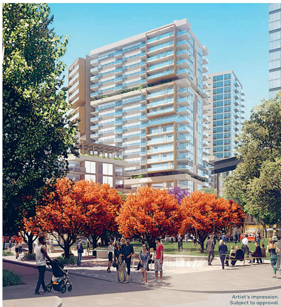
Artist's impression. Subject to approval.

Warrick Lane will be developed into a new landmark commercial hub that aims to attract big businesses and provide a central place for the community to work, play, eat and socialise. 2