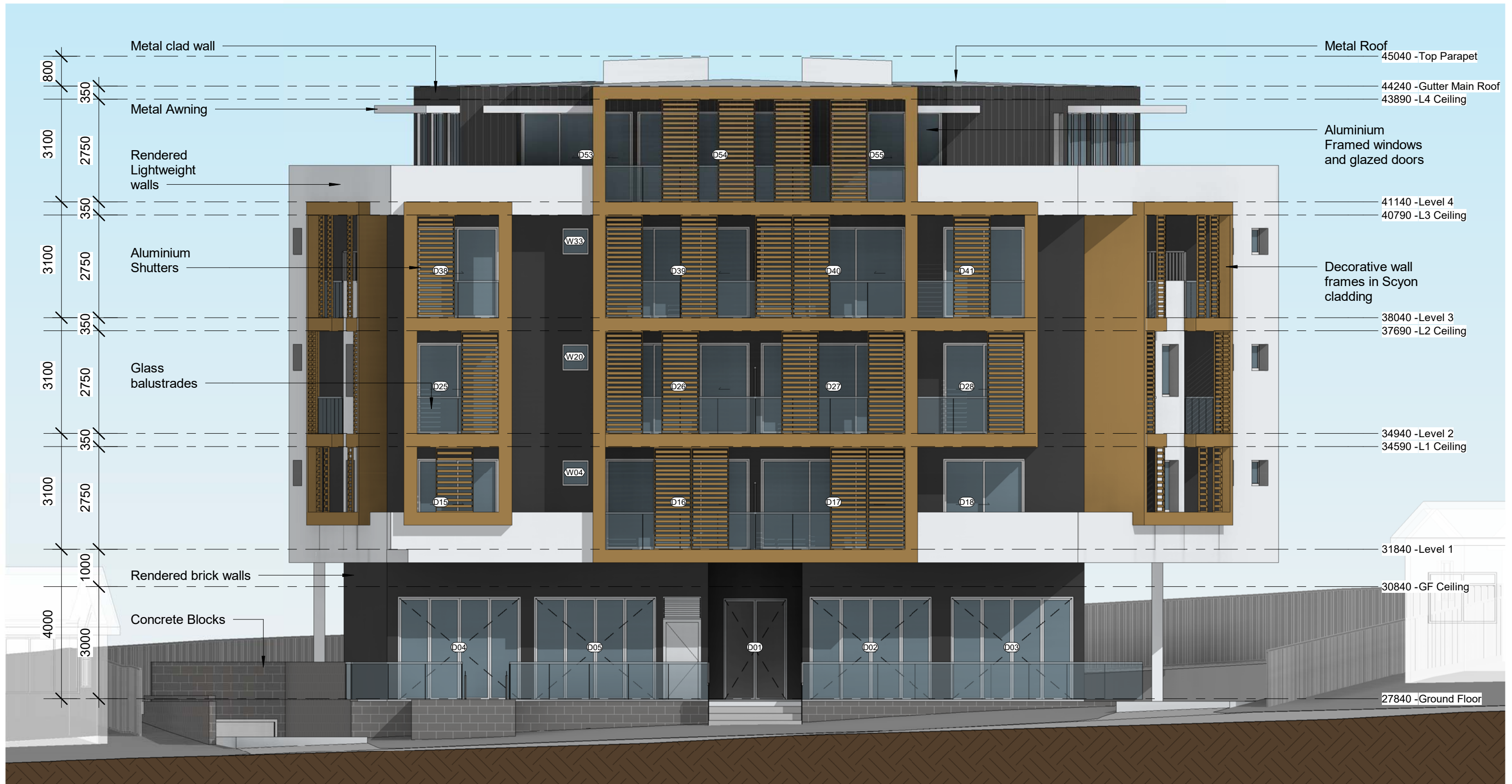
1 East Elevation 1 : 100