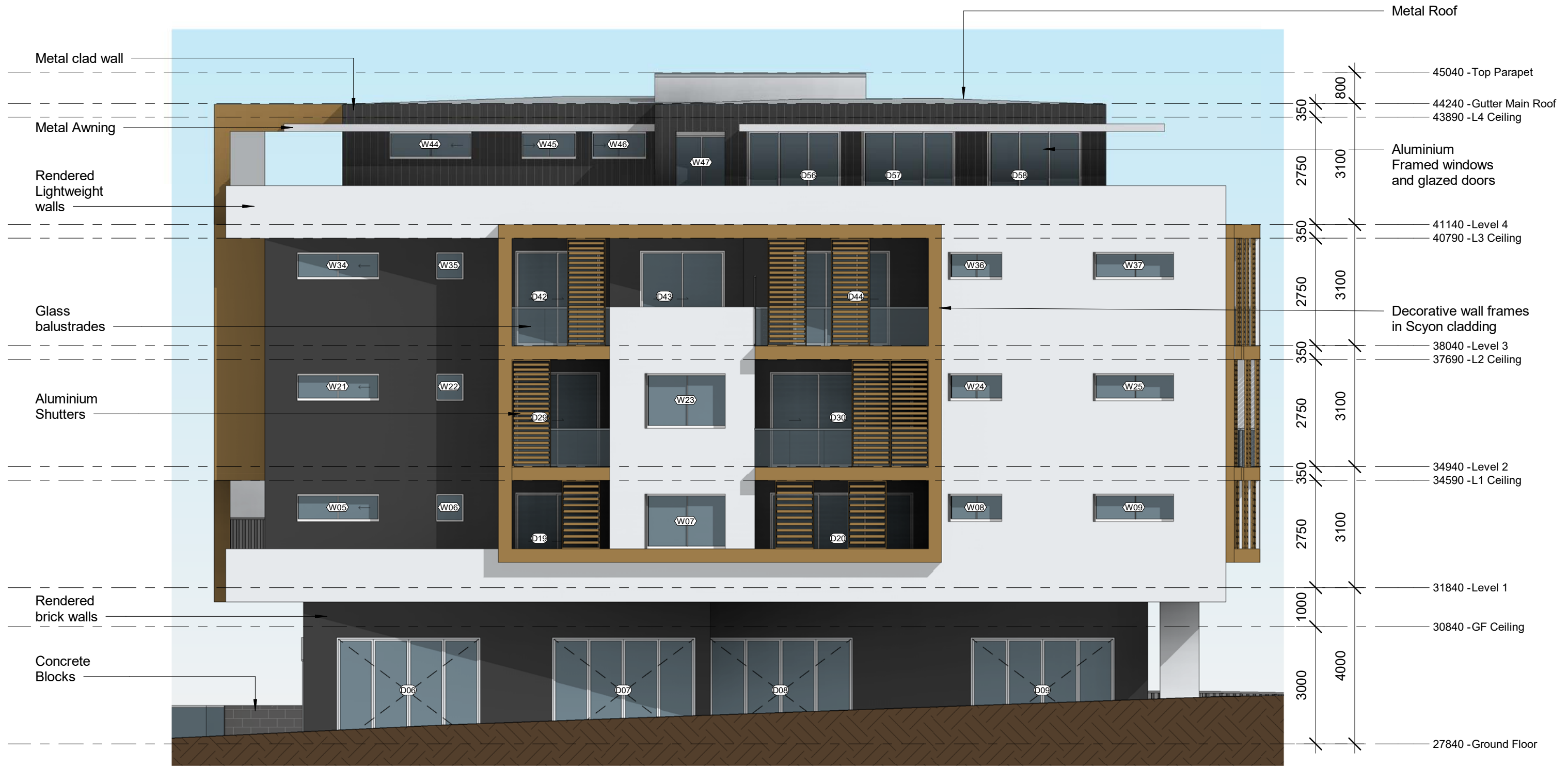
1 North Elevation 1 : 100