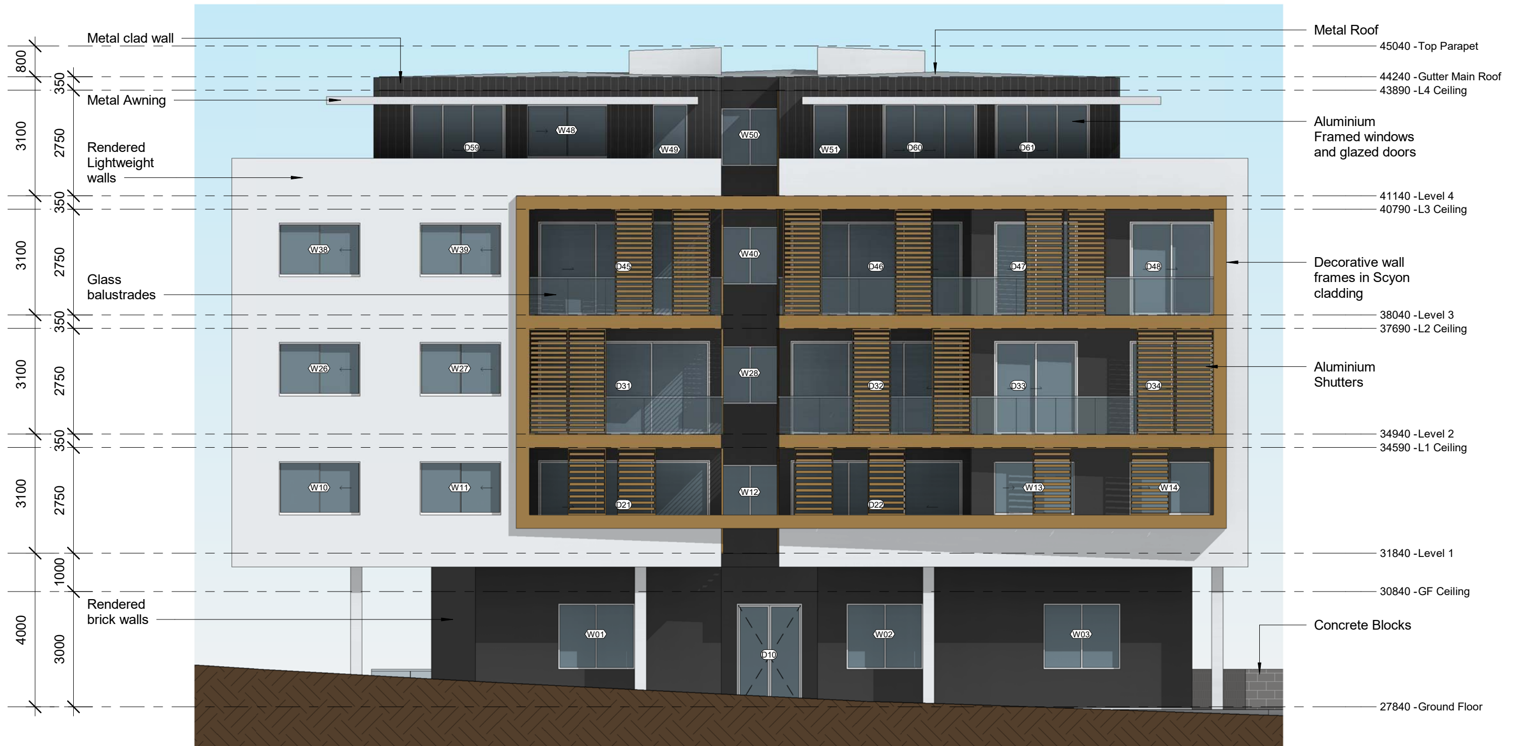
1 West Elevation 1: 100