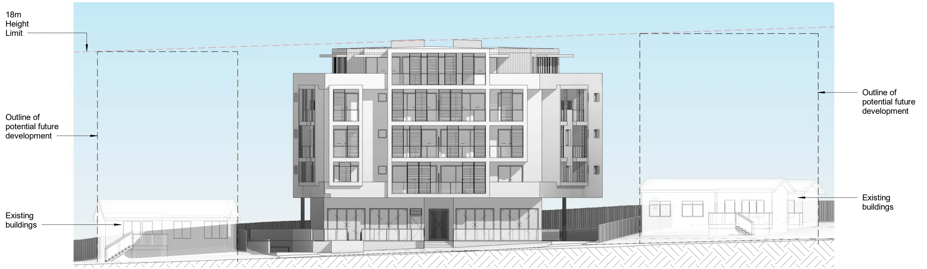
1 Streetscape Elevation 1 : 200