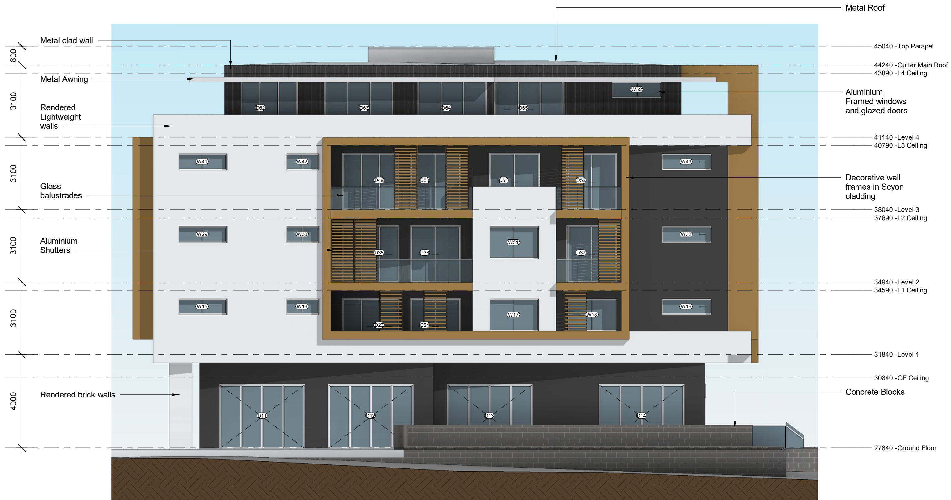
1 South Elevation 1 : 100