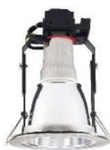
White Down Lights