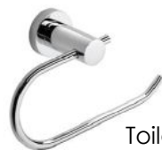
Toilet Roll Holder