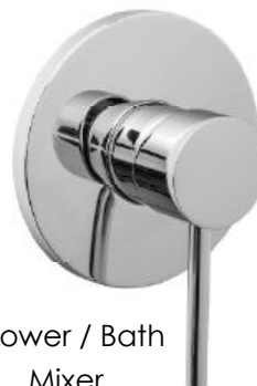
Shower / Bath Mixer