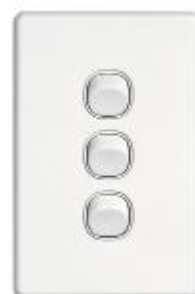
Three Gang Flush Switch