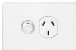
Single Power Point