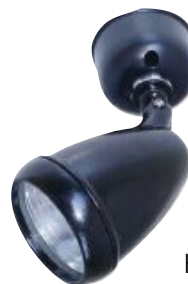
Single Halogen Lamp