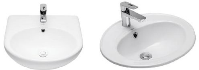
Semi Recessed Basin OR Recessed Basin