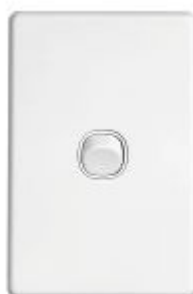
Single Flush Switch