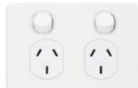
Double Power Point