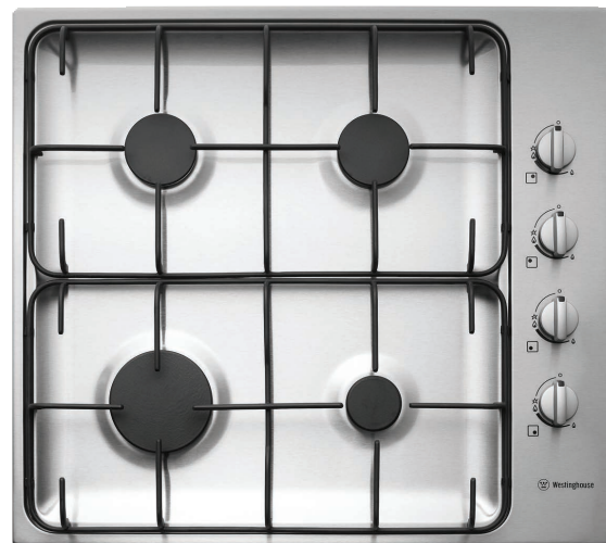
Current as at 15th September 2018