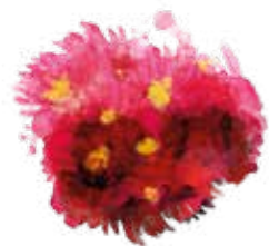
EUCALYPTUS SIDEROXYLON ROSEA (RED FLOWERING IRONBARK)

These design principles ensure that each home is well thought out and that the neighbourhood will present well for years to come.