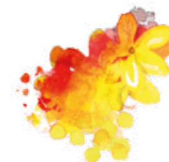
KOELREUTERIA PANICULATA (GOLDEN RAIN TREE)

Satterley Property Group is Australia's largest privately owned residential land developer, with communities in Victoria, Queensland and Western Australia. Satterley has delivered more than 165 residential projects and sold more than 60,000 lots to date, making it the sector's pacesetter for many years. Satterley has won over a hundred prestigious international, national and state awards for excellence in residential communities, environment and urban renewal. The simple fact is that the Satterley name is intrinsically linked with a reputation for development excellence.