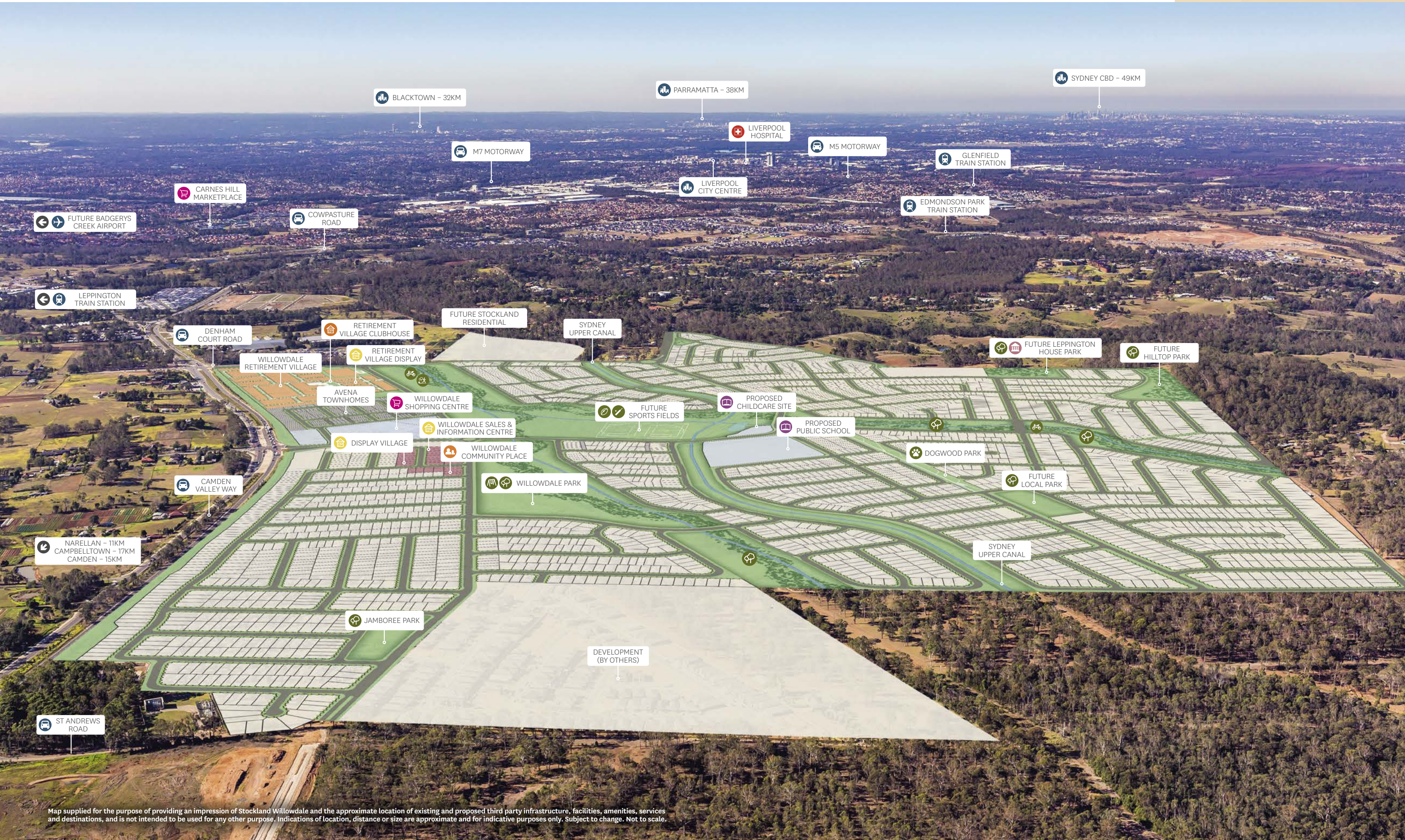
Map supplied for the purpose of providing an impression of Stockland Willowdale and the approximate location of existing and proposed third party infrastructure, facilities, amenities, services and destinations, and is not intended to be used for any other purpose. Indications of location, distance or size are approximate and for indicative purposes only. Subject to change. Not to scale.