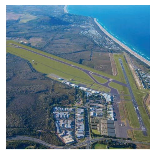
Sunshine Coast Airport Expansion $225 Million

The Sunshine Coast economy has doubled in the past decade and the current gross regional product is estimated to be close to $14b. The Sunshine Coast economy is forecast to reach $33b by 2033. With over $10b of infrastructure underway the coast boasts one of the highest job creation rates in Australia . Major developments are perpetuating the growth, with an extraordinary number of major developments in the works.