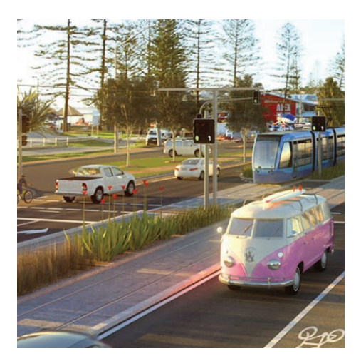
Sunshine Coast Light Rail Project $2 Billion