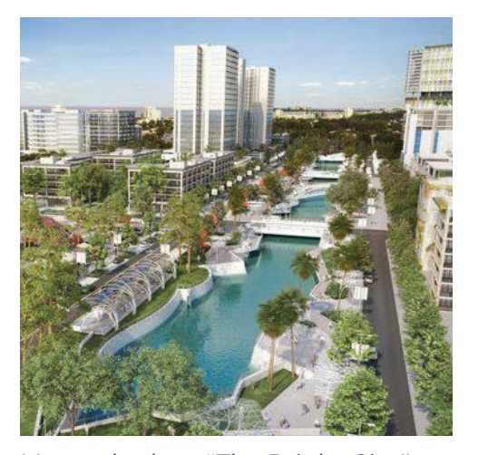
Maroochydore "The Bright City" $300 Million