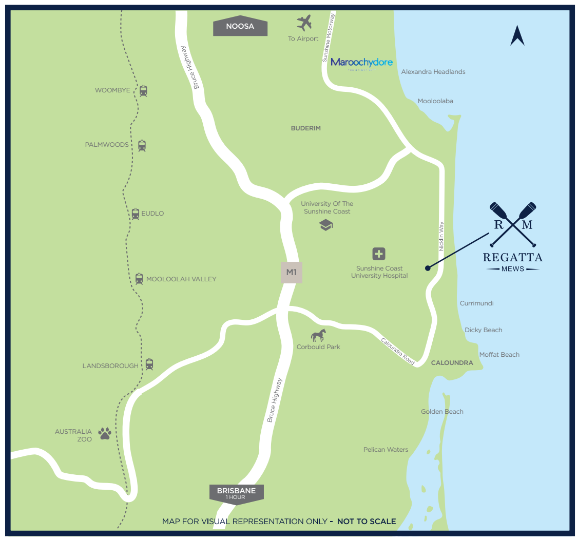
The Sunshine Coast is flagged to be the second fastest growing city in Australia by 2050.*