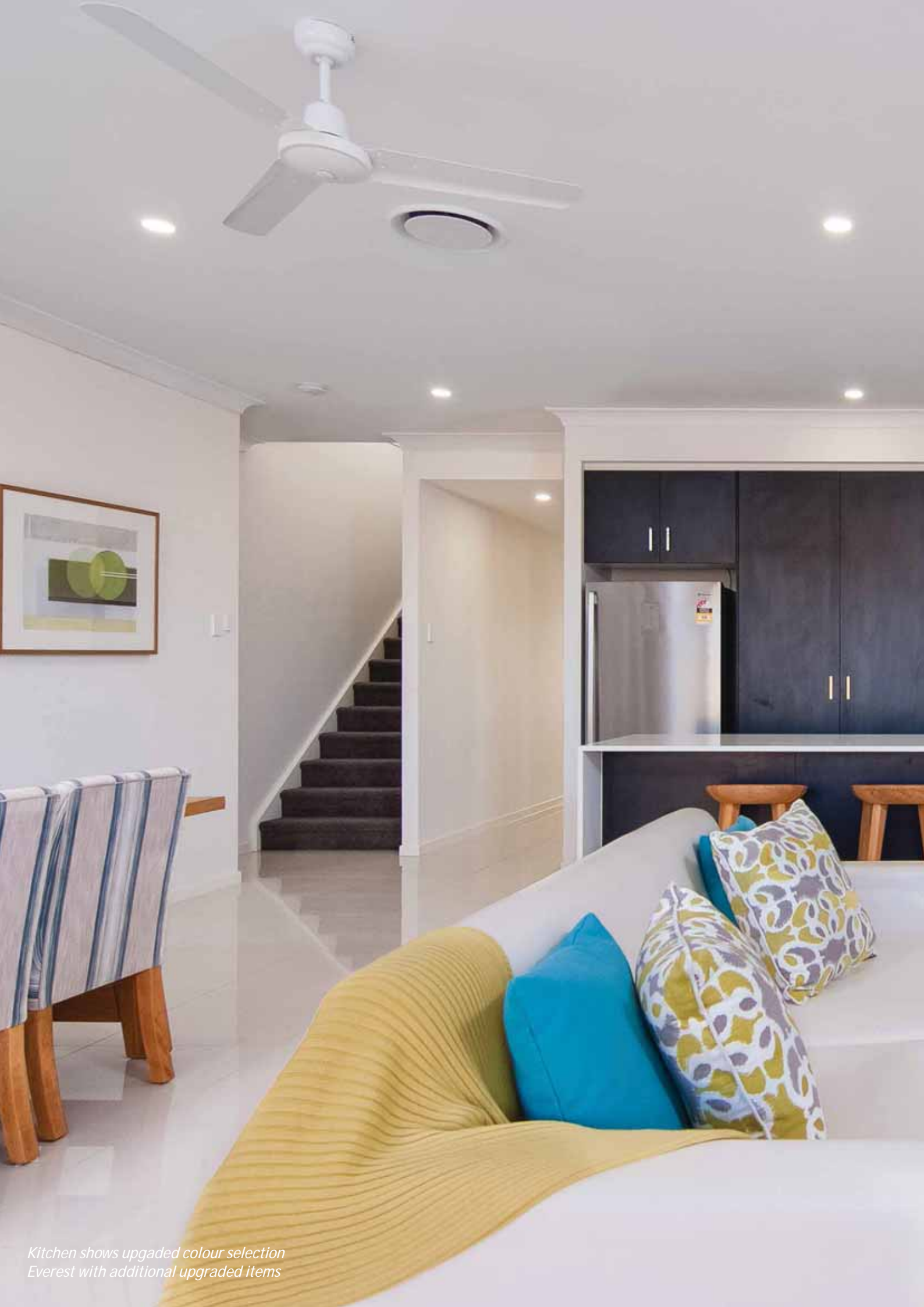
Kitchen shows upgaded colour selection Everest with additional upgraded items