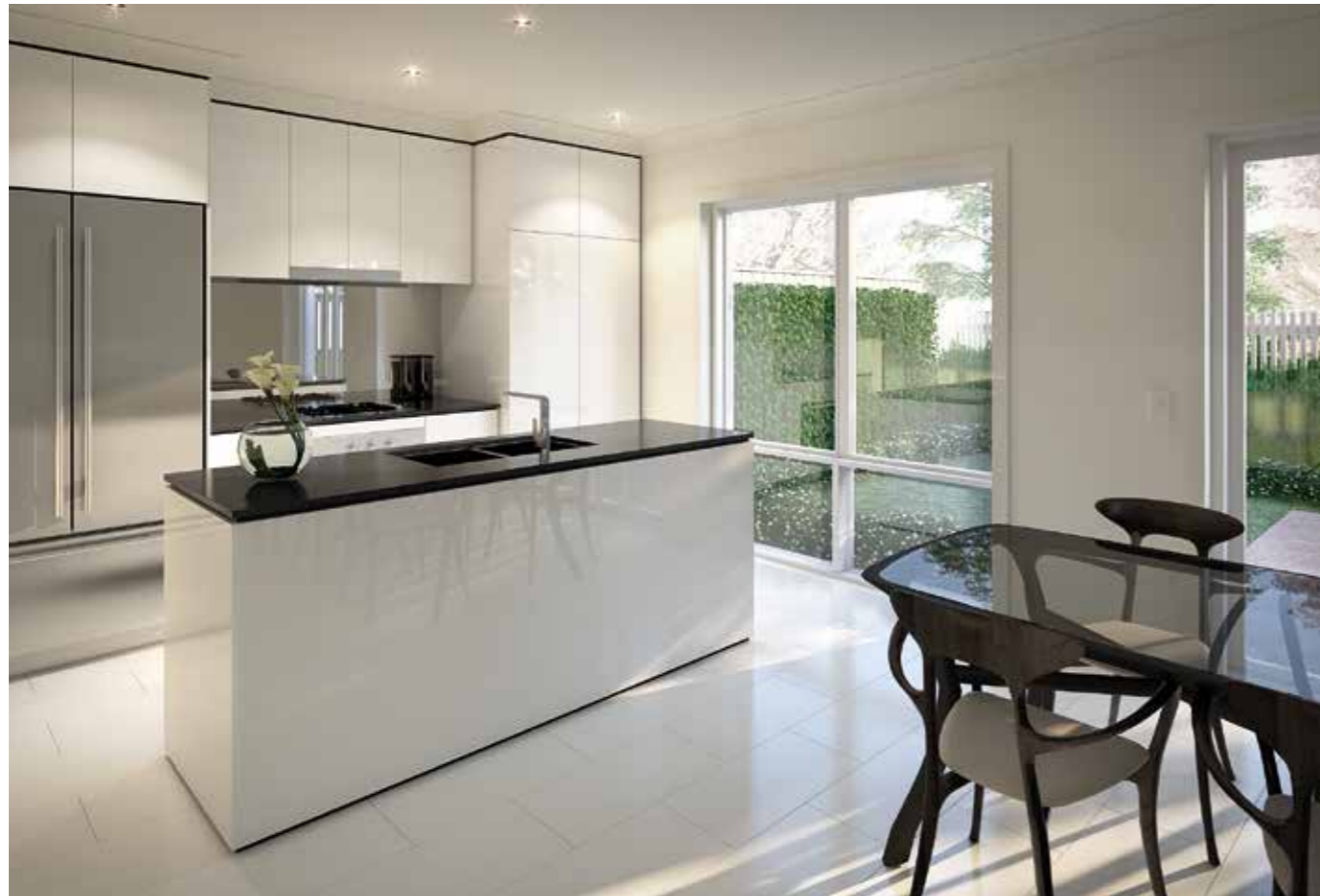
ARTIST IMPRESSION – INDICATIVE ONLY.

From the impressive main entry to the seamless flow of open plan living spaces, there is a welcoming sense of space and light that extends throughout the home to your private landscaped courtyard. Quality textures and soft neutral tones create a refined sophistication, from the rich softness of the carpet to the custom-made joinery. Select finishes, discreet storage solutions and understated colours create a contemporary canvas for your own personal style preferences.