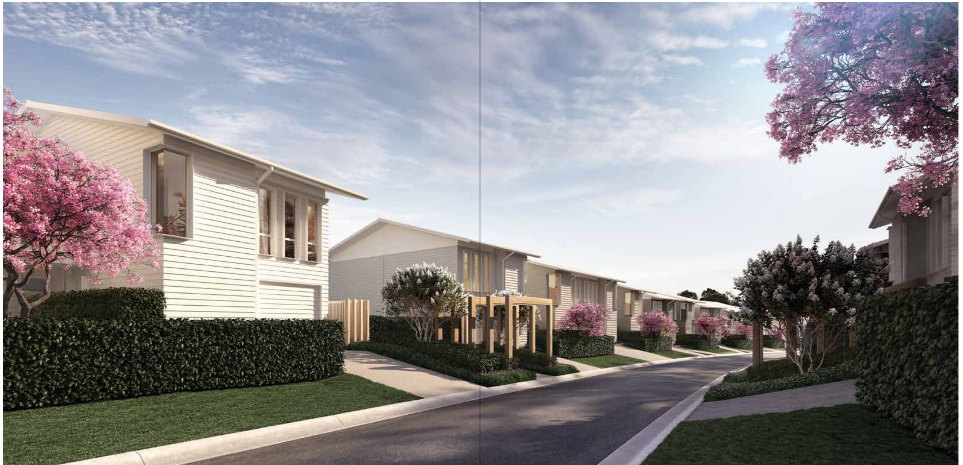
ARTIST IMPRESSION – INDICATIVE ONLY.

Set privately apart in a vibrant master planned community, Arbour Residences enjoys its own parkland environment tucked away from the wider world. Gently curving streetscapes, expansive landscaping, and the delicate changes in hue from one home façade to the next, creates both elegance and diversity. Homes present a selection of contemporary open plan designs featuring living, dining and entertaining spaces, three bedrooms, bathroom, master ensuite and powder room.