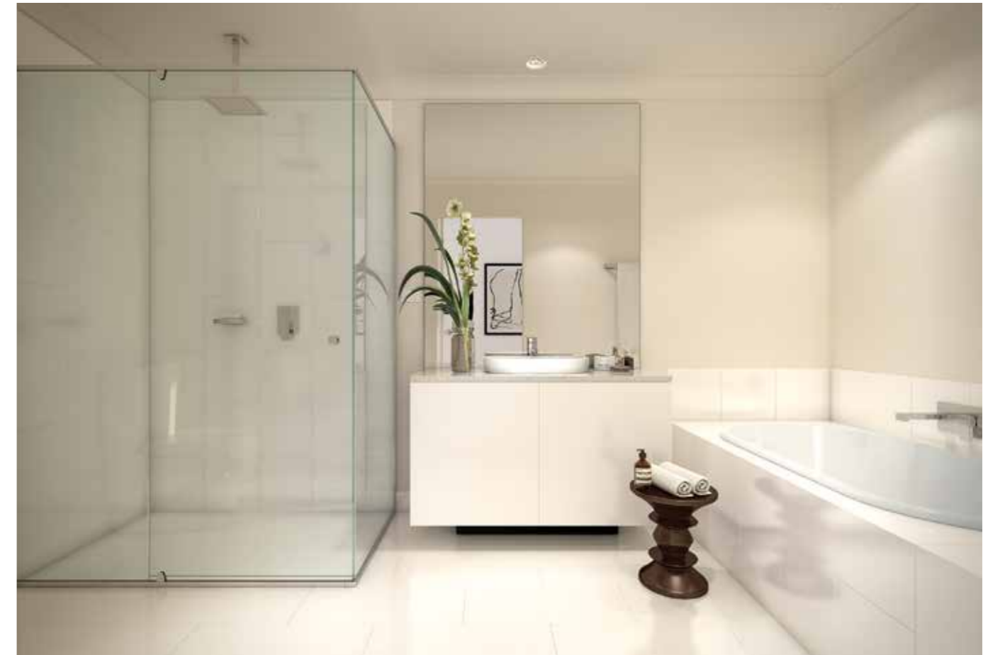
ARTIST IMPRESSION – INDICATIVE ONLY.

Manicured garden settings frame the views from the kitchen, which features quality reconstituted stone bench tops, high-gloss cabinetry with ample storage and stainless steel appliances.