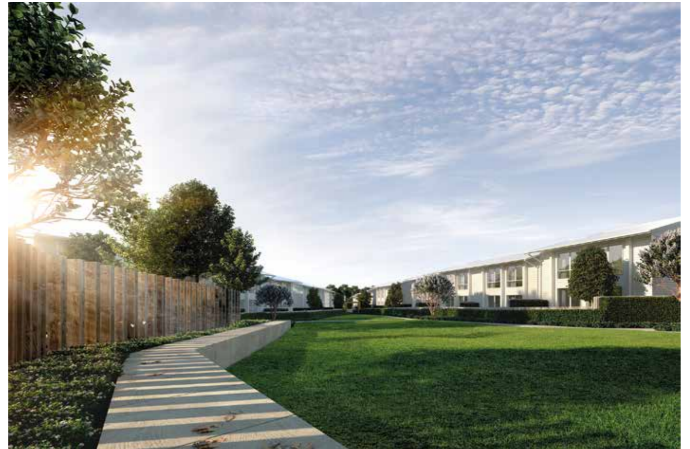
ARTIST IMPRESSION – INDICATIVE ONLY.

Arbour Residences presents a private collection of 113 premium terrace homes adjoining an expansive conservation corridor. The natural beauty of this community is further enhanced by a series of communal parks and open green spaces, intertwined with beautiful garden arbour settings. These spaces embrace the warmth of neighbourhood connection and the joy of the outdoors – encouraging activity, and a sense of sharing and belonging. Each home is impeccably landscaped, softened by flowering trees and gardens to create an enduring bond between the living and built environments.