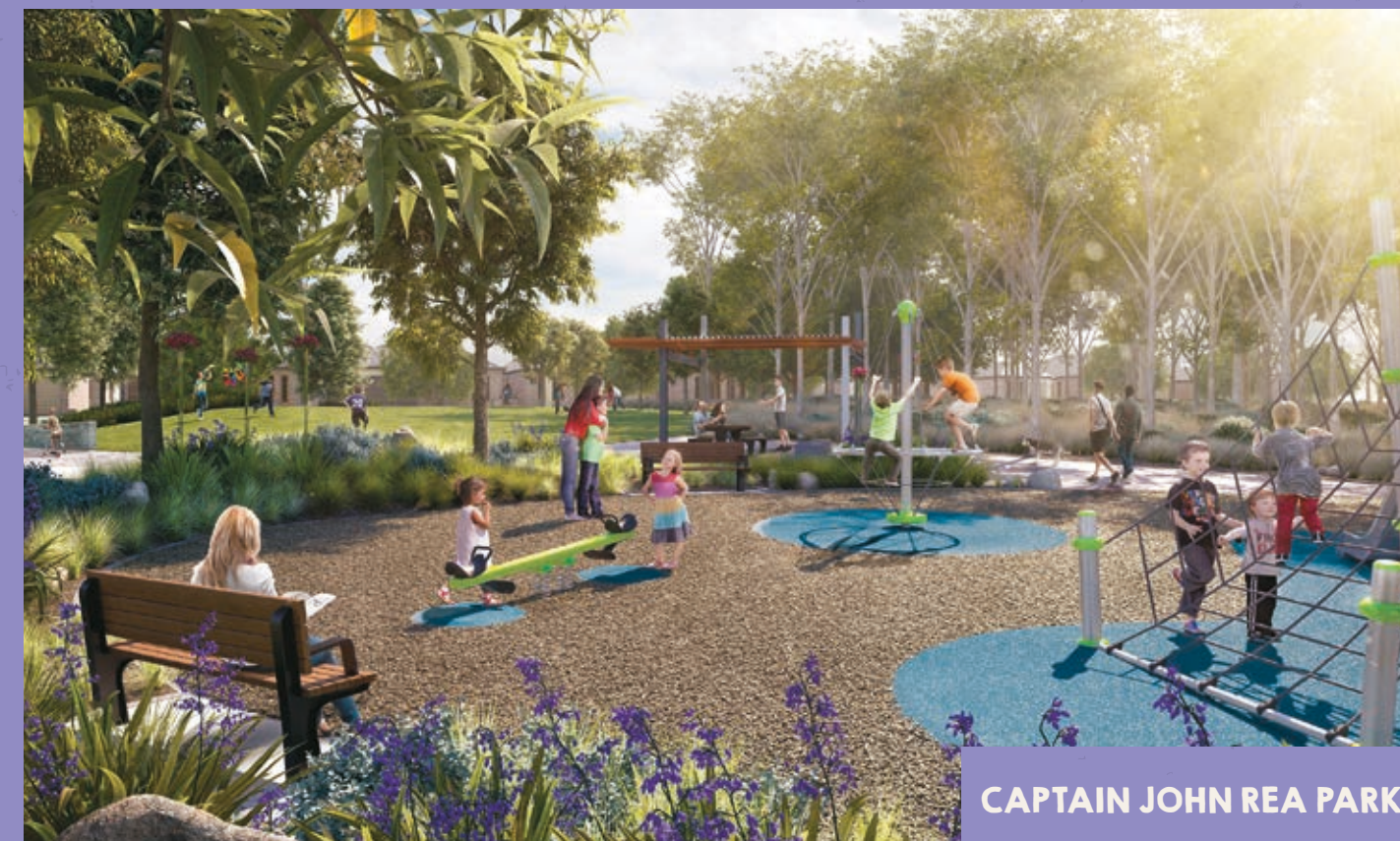
CAPTAIN JOHN REA PARK