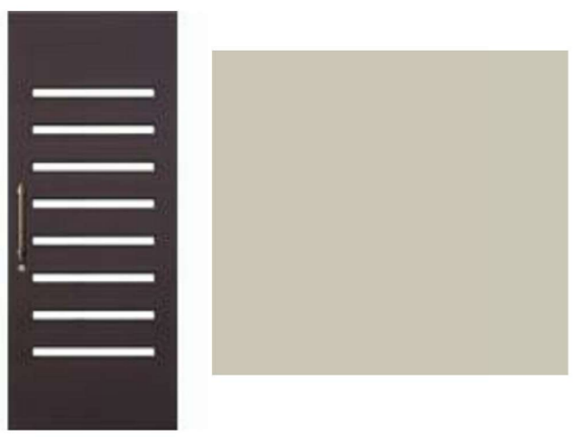
Corinthian front door - Taubmans Flint Smoke