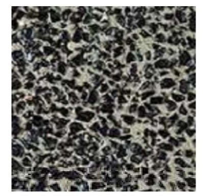
Driveway Boral Salt 'n' Pepper exposed agg

NOTES This plan may not be copied without the express written authority of Mullak Design Group or Urbane Homes. The copywrite of these drawings remains in the ownership and control of Urbane Homes unless express written permission is given otherwise. Any contours, base information, site data or any other information have been derived from other consultants information therefore Mullak Design Group accepts no responsibility for the accuracy of the data supplied. Mullak Design Group accepts no responsibility for loss or damage caused to any person who may rely on the information for any purpose for which it was not intended. All dimensions, sizes and areas shown on this drawing are approximate only and are to be confirmed by all consultants prior to construction on site. Figured dimensions take precedence. The builder is to verify all site dimensions. Do not scale off drawings. All construction to be in accordance with Building Code of Australia 2015 Volume 2, relevant Australian Standards. Local Authority requirements and Queensland legislation.