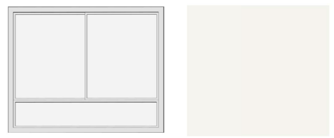
Aluminium sliding window - frame colour Surfmist