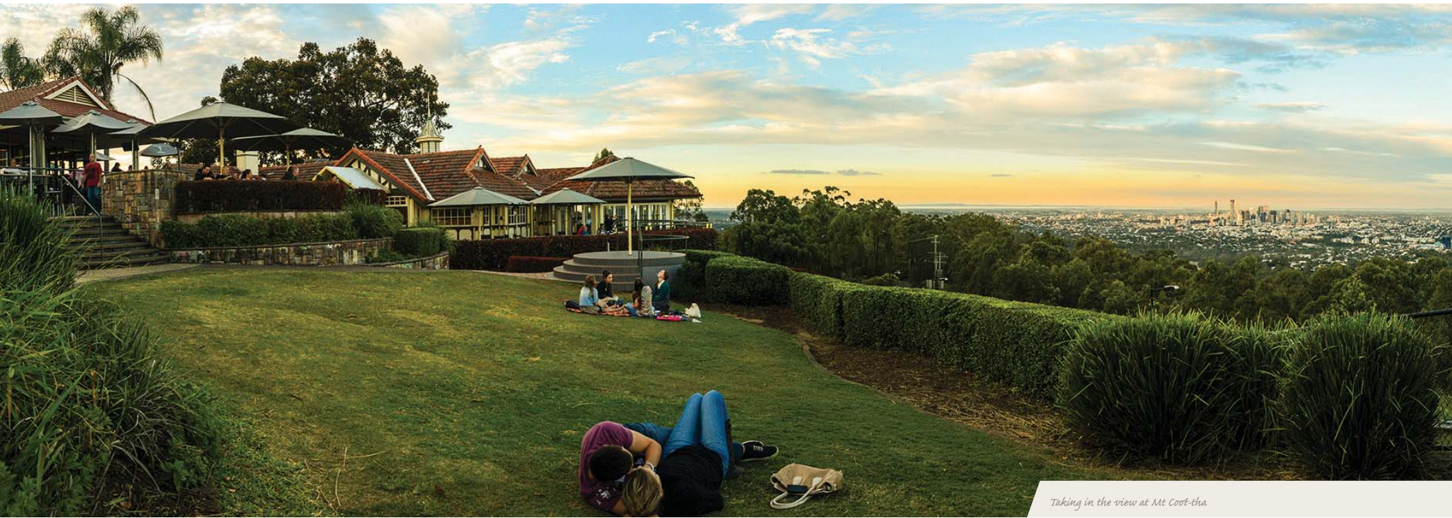
Taking in the view at Mt Coot-tha