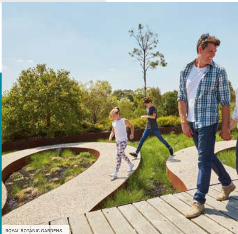
ROYAL BOTANIC GARDENS.

Everything you need will be only moments away. The future Botanic Village will include a Coles supermarket, café and specialty stores. A future primary school, community centre and sports fields nearby are also proposed.