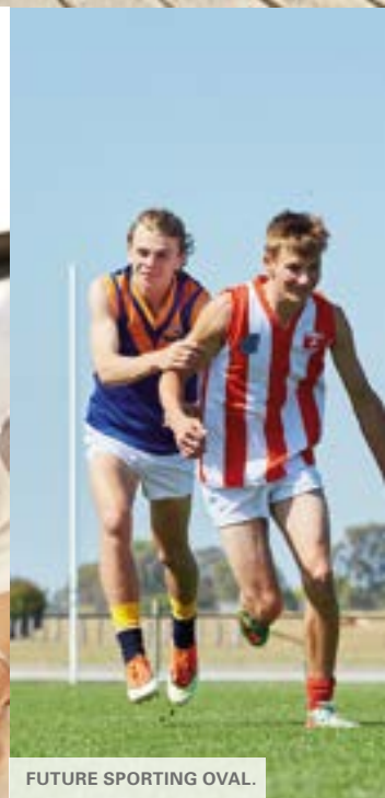
FUTURE SPORTING OVAL.