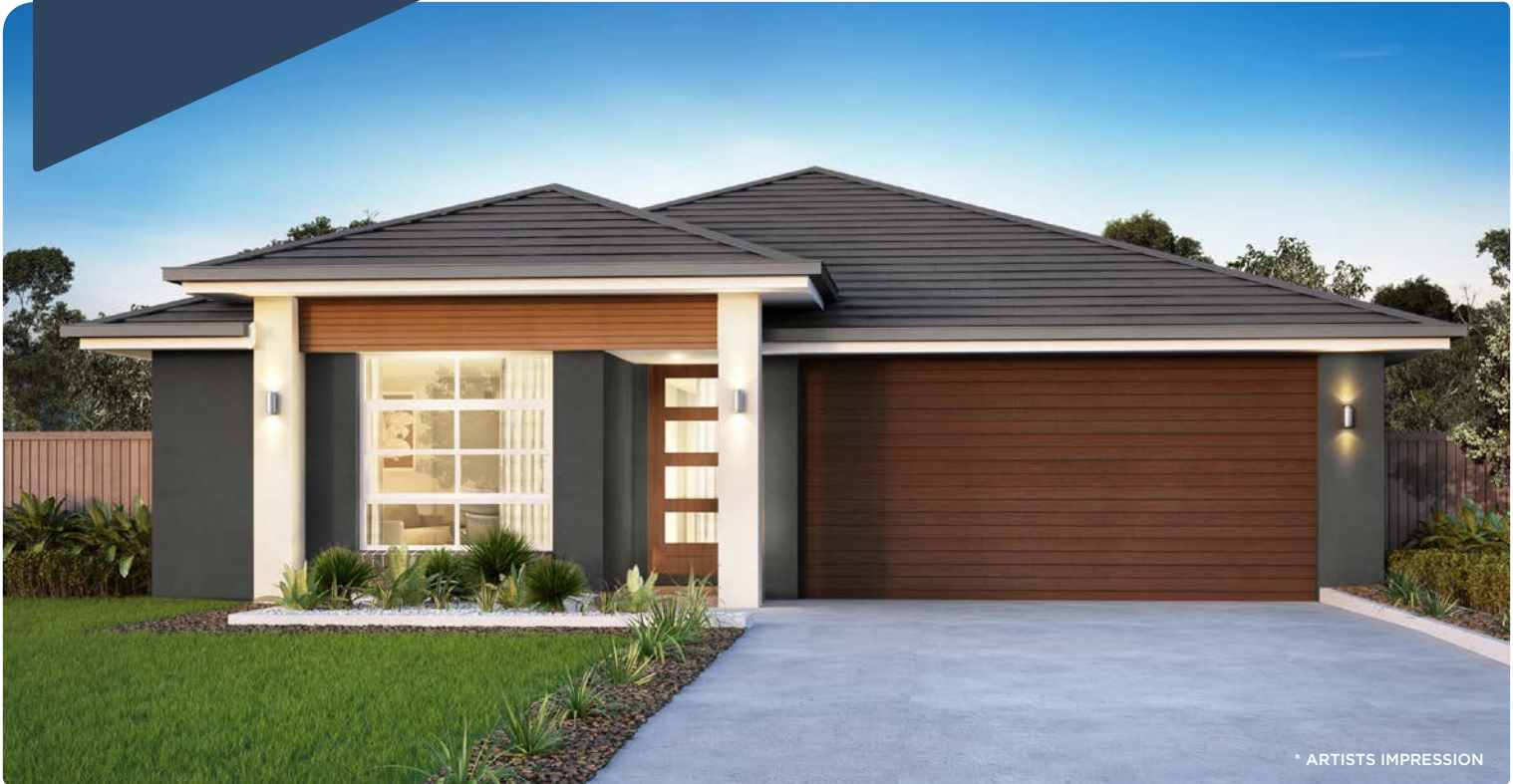
* ARTISTS IMPRESSION