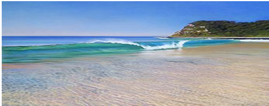
White Sand and Blue Water Beaches